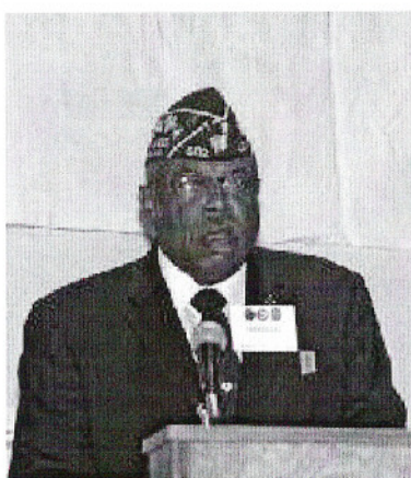
JOHNNIE SQUARE POST #502, BATON ROUGE DISTRICT 6